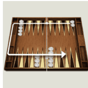
Direction of Pieces